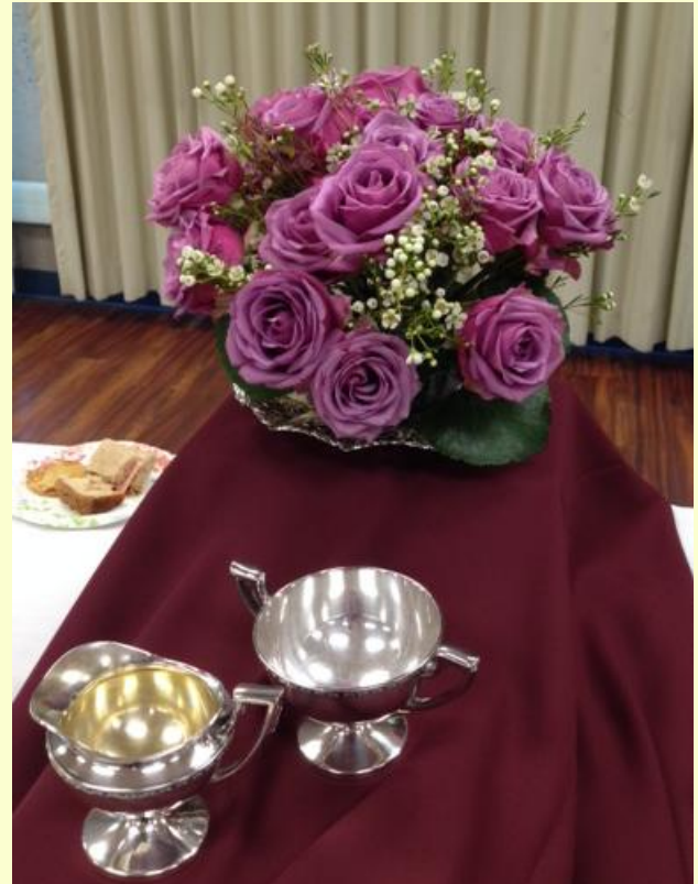
Centerpiece for February 23, 2015 General Meeting