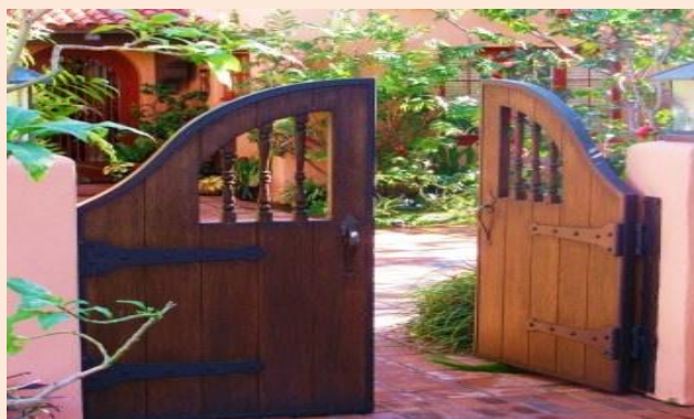
A hidden garden

Self-guided tour around beautiful gardens in historical neighborhoods surrounding Balboa Park.